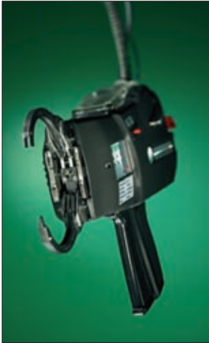
Autotool System 3080.

It is now possible to fit fixings (sometimes known as foot parts) in conjunction with automatic cable tying. This is best suited to applications where either high volume manufacture or flexible production methods are needed.