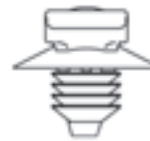
Fir Tree ATS FT6