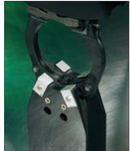
... the strap is tied automatically through the head of the footpart, ...