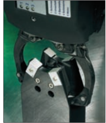
The footpart is placed, ...