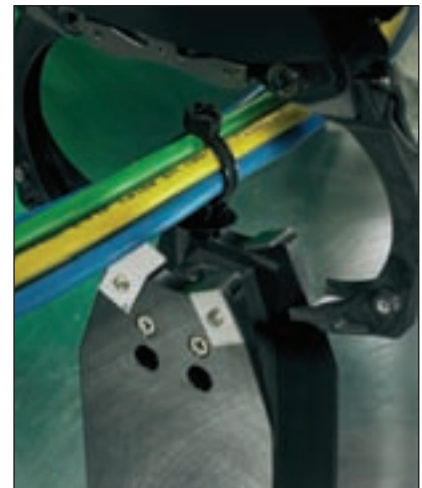
... and the harness is completely bundled including the footpart.